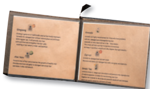
There is English menu for the coloring as well.

There is a variety in hair treatment menu. Written precisely that it is easy to understand even for the first visit customers.